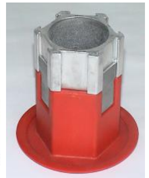
+30 = 80 mm