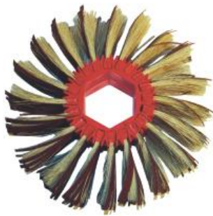
Quick Flex 20 seg./65/50