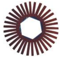
Quick Star 140/HX