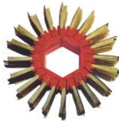
Quick Flex 20 seg./40/50