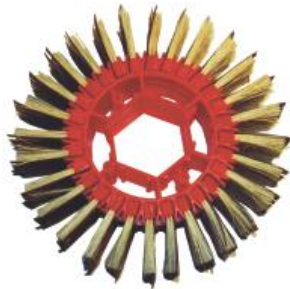
Quick Flex 28 seg./40/50